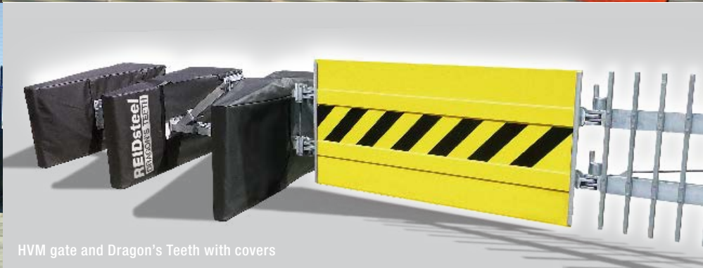
HVM gate and Dragon's Teeth with covers