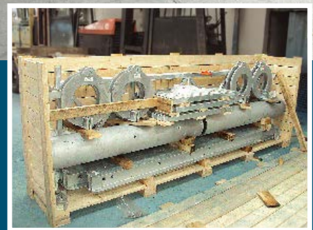
Above: 6m anti lorry gate, ready for despatch

John Reid & Sons (Strucsteel) Ltd, Strucsteel House, 3 Reid Street, Christchurch, Dorset BH23 2BT England Tel: +44 (0) 1202 483333 • Fax: +44 (0) 1202 470103 Email: sales@reidsteel.co.uk • Web: www.reidsteel.com