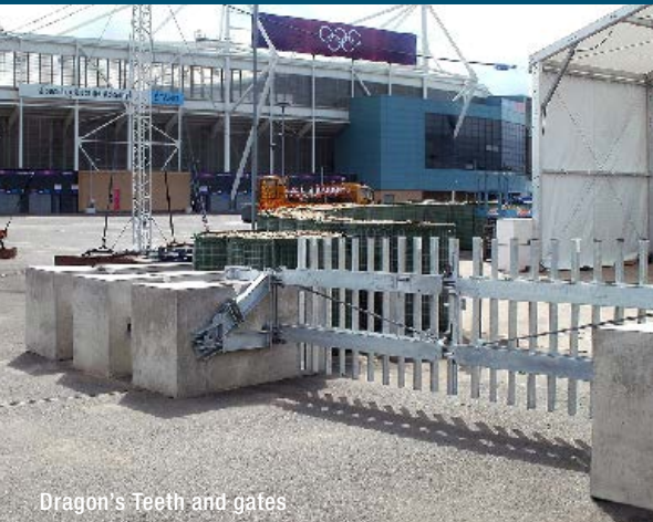
Dragon's Teeth and gates