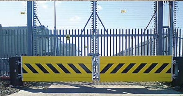
HVM Gates at power station entrance